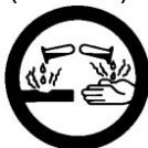
CANADA (WHMIS) SYMBOLS