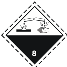
US DOT SYMBOLS